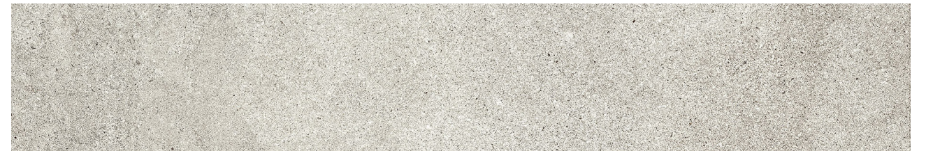
GRIGIO 600x600x9.5mm Matt R10 600x600x9.5mm Chevron 600x600x9.5mm Bush-hammer 600x600x20mm Anti-slip R11 600x1200x10.7mm Matt R10 600x1200x20mm Anti-slip R11 B60C1854T-95 B60C1854T-95CV B60C1854T-95BH B60C1854-20 B62C1854T-10 B62C1854-20 CUSTOMIZED