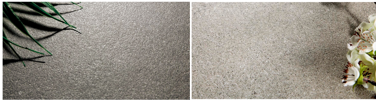
Matt / R10