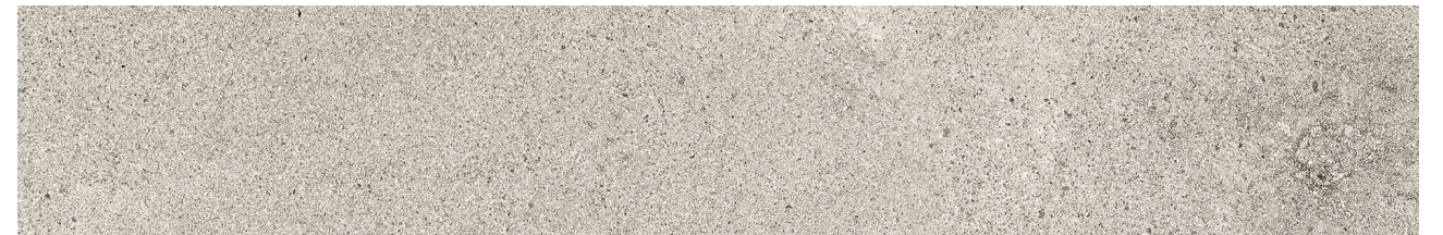
TAUPE 600x600x9.5mm Matt R10 600x600x9.5mm Chevron 600x600x9.5mm Bush-hammer 600x600x20mm Anti-slip R11 600x1200x10.7mm Matt R10 600x1200x20mm Anti-slip R11 B60C1855T-95 B60C1855T-95CV B60C1855T-95BH B60C1855-20 B62C1855T-10 B62C1855-20 CUSTOMIZED