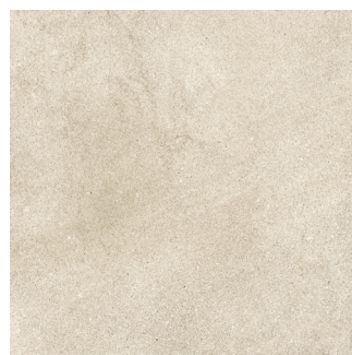
24 FACES BEIGE Matt R10 B60C1853T-95 600x600x9.5mm 24"x24"