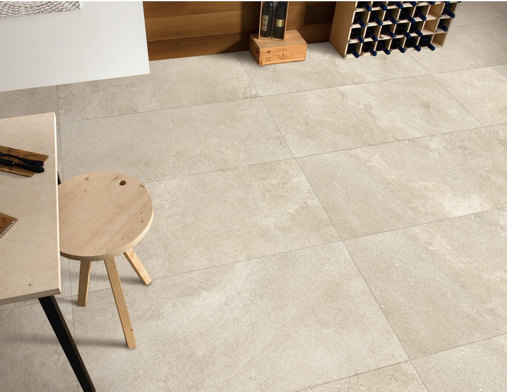
NUAGE BEIGE Matt R10 B62C1853T-10 600x1200x10.7mm 24"x48"