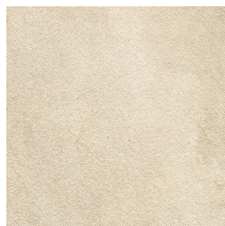
24 FACES BEIGE Chevron B60C1853T-95CV 600x600x9.5mm 24"x24"