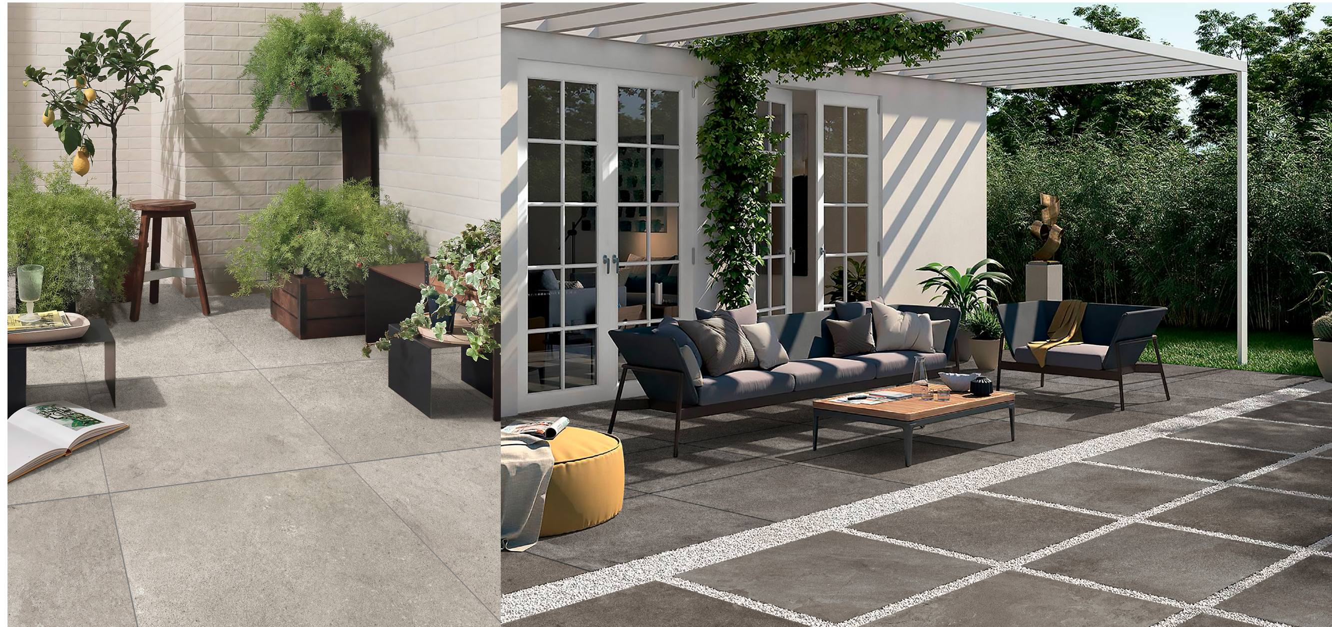
NUAGE TAUPE Matt R10 B60C1855T-95