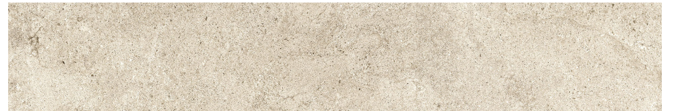
BEIGE 600x600x9.5mm Matt R10 600x600x9.5mm Chevron 600x600x9.5mm Bush-hammer 600x600x20mm Anti-slip R11 600x1200x10.7mm Matt R10 600x1200x20mm Anti-slip R11 B60C1853T-95 B60C1853T-95CV B60C1853T-95BH B60C1853-20 B62C1853T-10 B62C1853-20 CUSTOMIZED