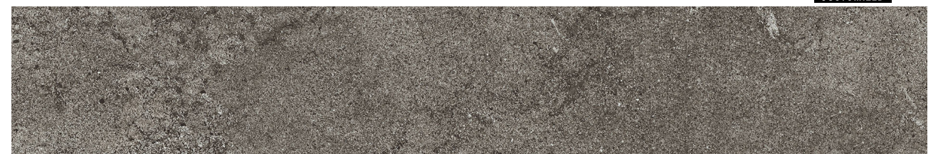
NERO 600x600x9.5mm Matt R10 600x600x9.5mm Chevron 600x600x9.5mm Bush-hammer 600x600x20mm Anti-slip R11 600x1200x10.7mm Matt R10 600x1200x20mm Anti-slip R11 B60C1856T-95 B60C1856T-95CV B60C1856T-95BH B60C1856-20 B62C1856T-10 B62C1856-20 CUSTOMIZED