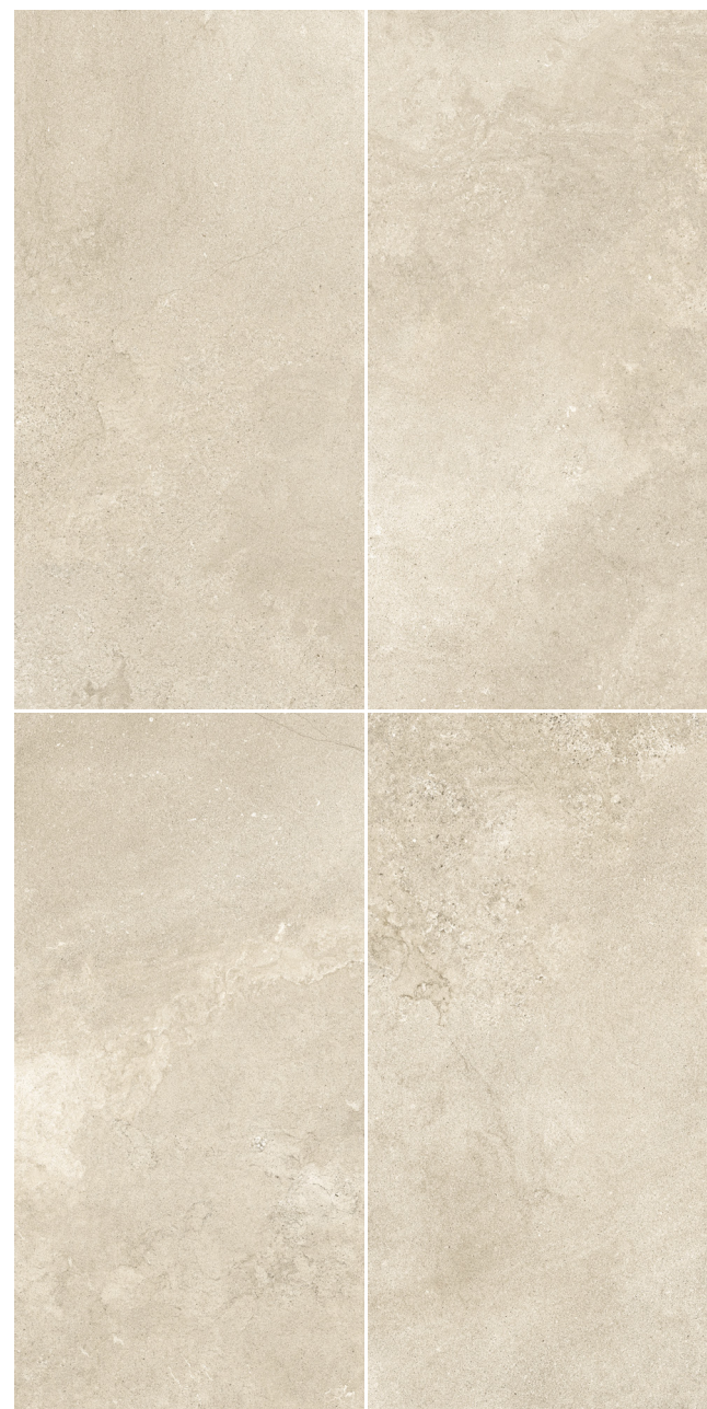
12 FACES BEIGE B62C1853T-95 600x1200x10.7mm 24"x48"