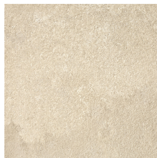
24 FACES BEIGE Bush hammer B60C1853T-95BH 600x600x9.5mm 24"x24"