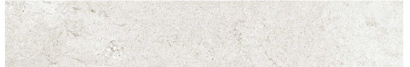
CREAM 600x600x9.5mm Matt R10 600x600x9.5mm Chevron 600x600x9.5mm Bush-hammer 600x600x20mm Anti-slip R11 600x1200x10.7mm Matt R10 600x1200x20mm Anti-slip R11 B60C1852T-95 B60C1852T-95CV B60C1852T-95BH B60C1852-20 B62C1852T-10 B62C1852-20 CUSTOMIZED