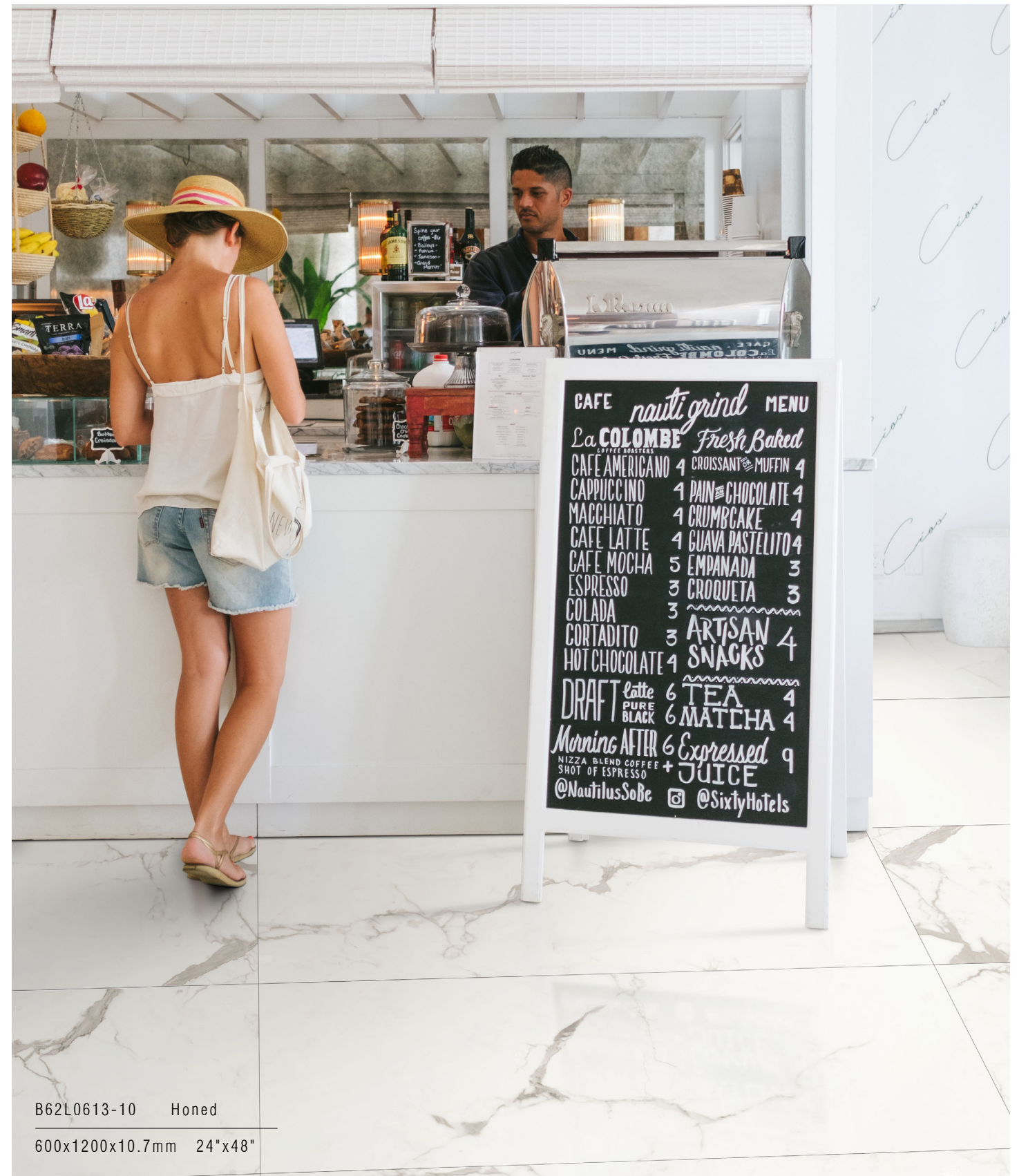
B62L0613-10 Honed 600x1200x10.7mm 24"x48"