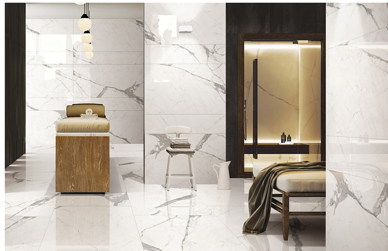
B62M0333-10 Polished 600x1200x10.7mm 24"x48"